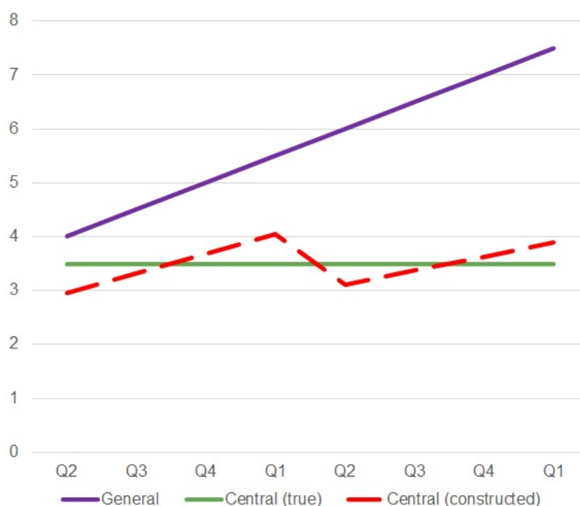
Figure 3 – Illustration example of spurious dynamics in the interpolated central government investment series.

Note: The purple line represents general government investment that grows at a constant rate. The green line represents central government investment that keeps constant over time. The red dashed line represents interpolated central government investment based on the method in Hamer-Adams and Wong (2018) and Parkyn and Vehbi (2014). In New Zealand, Q2 is the first quarter in a fiscal year.