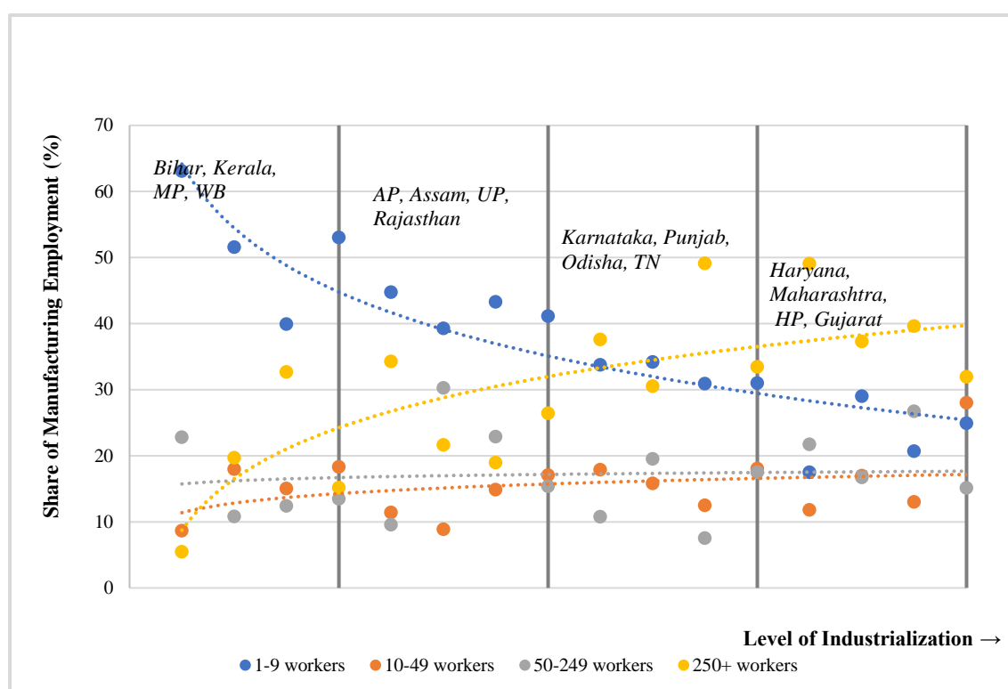
Figure 3: Differences in Employment Distribution by Enterprise Size in Manufacturing Sector Across States (2015-16)

Source: Author's calculations from plant level data of ASI and NSS Unincorporated Enterprise Surveys (2015-16) and RBI's Handbook of Statistics on Indian Economy