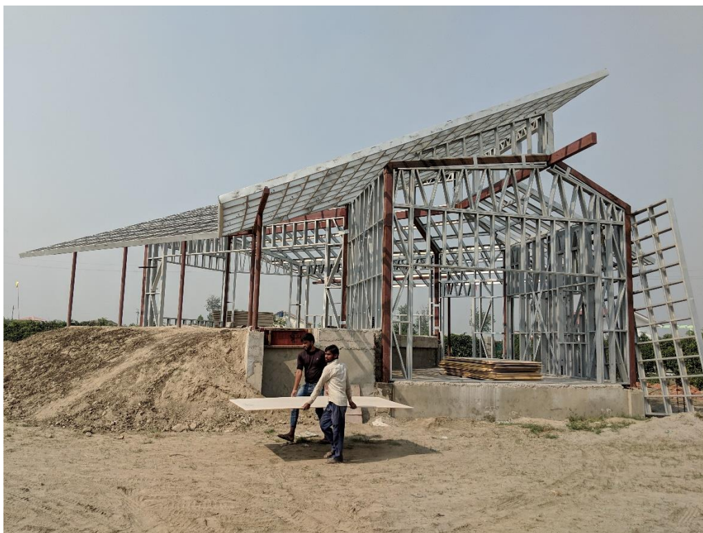
Diagram 3: Light gauge steel framed structure