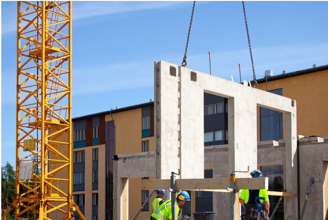
Diagram 4: Precast wall panel

Precast technologies involve the manufacture of various components of the superstructure of the building in an offsite plant and assembling these components on site. Columns, beams, slabs, walls, stairs, and even entire rooms are manufactured in an offsite plant, transported to the site and assembled to form the superstructure (Diagram 4). The precast components are assembled with the help of cranes and other machinery, and joined together using joinery elements like splices, billets, bolts and inserts of different shapes and sizes depending on structural design requirements. The kind of cranes and other machinery required on site depends on the volume, the size of the precast components and the height of the building. Once assembled and joined together, the building only requires finishing work in terms of electrical work, plumbing work, flooring, painting and other internal and external finishes. Precast technologies involve moving a significant proportion of the construction process offsite to a factory-controlled environment.