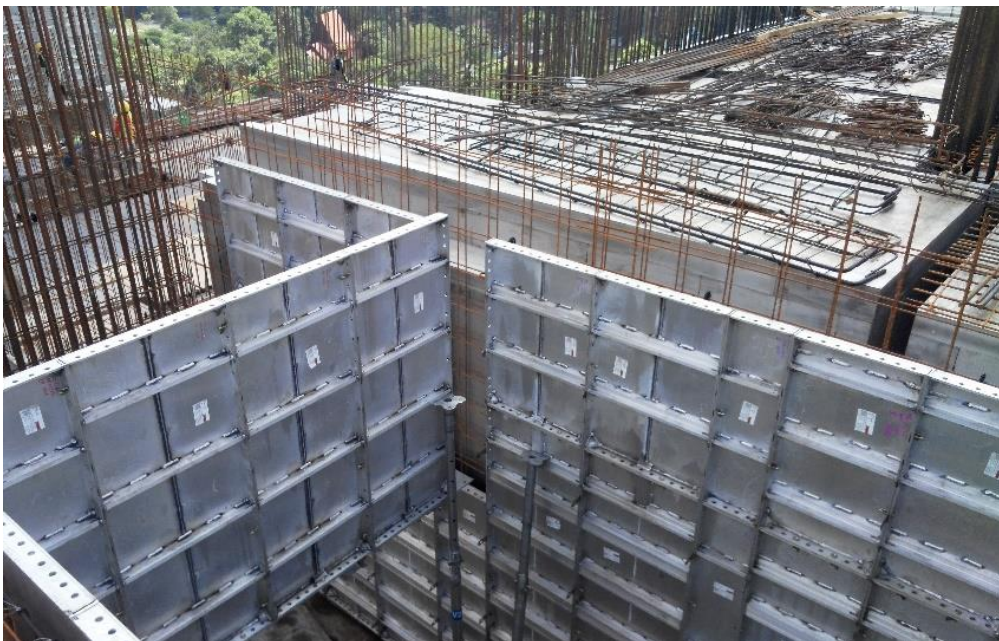
Diagram 2: Engineered formwork system made of aluminium

Such alternate formwork systems are of two types – engineered formwork systems and stay-in-place formwork systems. In engineered formwork systems, the formwork is dismantled once the concrete is set. Engineered formworks are made of aluminium, plastic or other composites (Diagram 2). They can be used for 300 to 500 repetitions and can be used for low-rise as well as high-rise structures (Building Materials and Technology Promotion Council, 2018). Stay-in-place formworks are suitable for low rise and mid-rise buildings. In a stay-in-place formwork system, the formwork is left within the concrete and thus becomes a part of the building. Engineered formwork and stay-in-place formwork is manufactured in factories by firms specialising in the manufacture of these alternate formwork systems and are made to order. In most cases, these alternate formworks are imported from outside India, where they are designed and manufactured exclusively for the project.