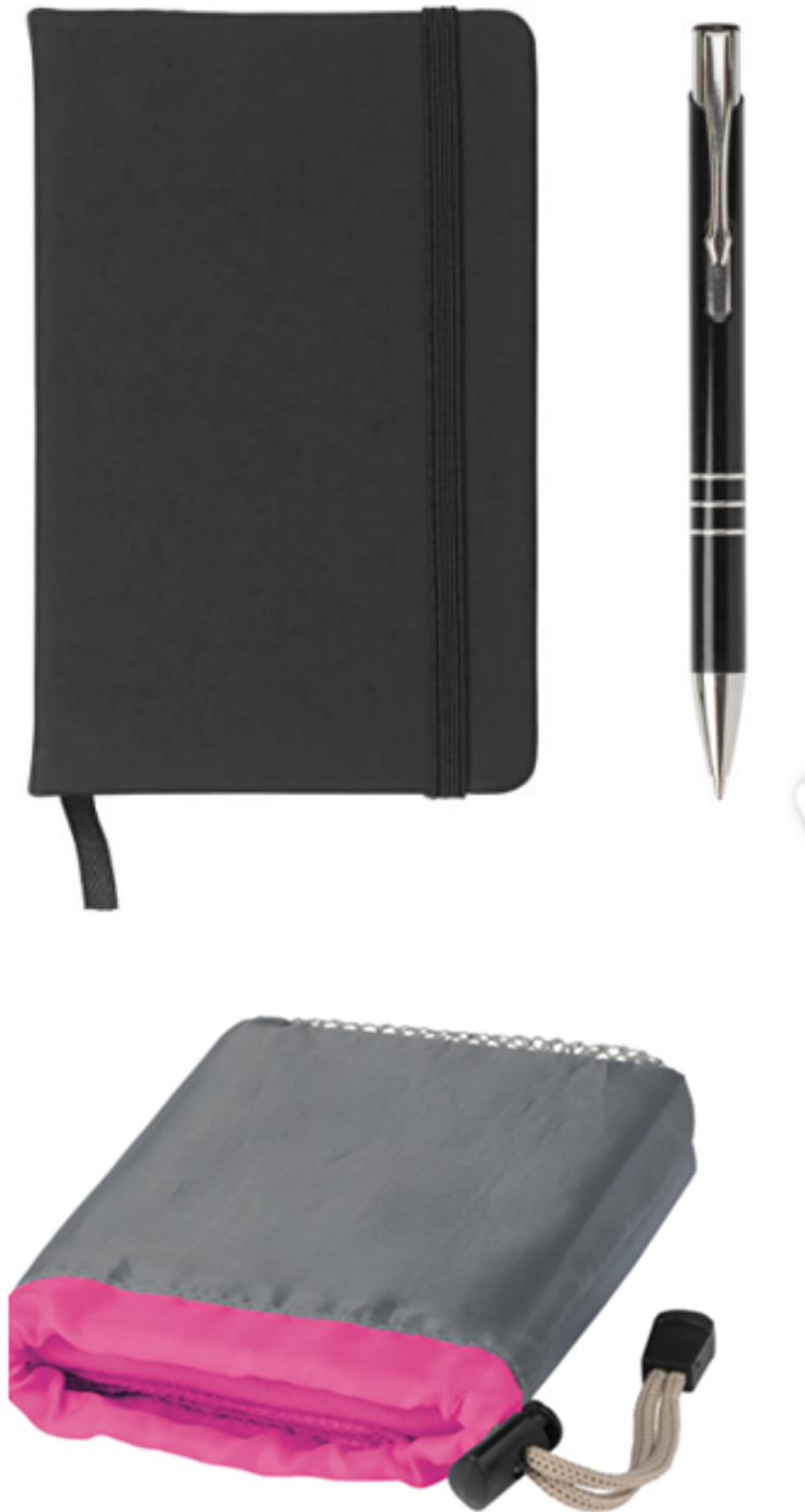
Figure A1: Items used in the experiment