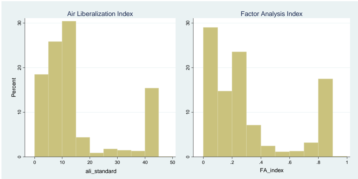
Figure 1: Histograms of the degree of liberalization of the aviation market