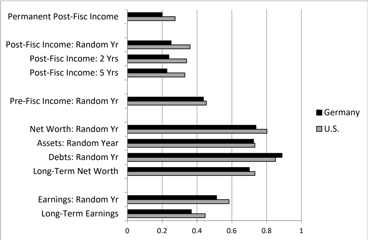
Figure 1. Gini Coefficients in Permanent Income, Short-Term Income, Short and Long Term Wealth, and Earnings in Germany and the U.S. Source: Adapted from the Online Appendix to Brady et al. (2018).

To understand stratification in income and wealth, we often describe how unequally distributed those economic resources are. Societies with higher levels of income and wealth inequality are likely to be societies with more skewed distributions of political power and greater social problems. Inequality also undermines cohesion, solidarity and community. Arguably, a highly unequal society is also unjust (Atkinson 2015; Sen 1992). Despite claims common in Economics textbooks, inequality is probably not even efficient (Kim and Sakamoto 2008).