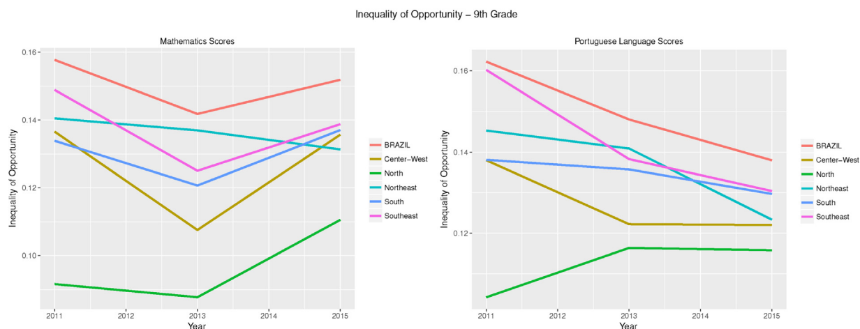
Fig. 4. Figure of inequality of opportunity in 9th grade evolution 2013–2015.