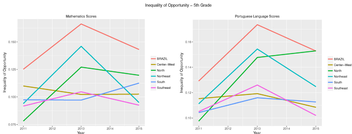
Fig. 3. Inequality of opportunity in 5th grade evolution 2013–2015.