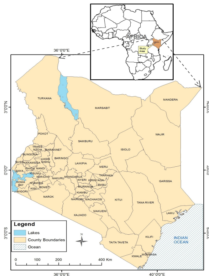
Figure 2: Geographical Map of Kenya showing the Study Area

This study was carried in Kenya. Kenya is located in the continent of Africa. Kenya lies across the equator and is found in the eastern coast part of Africa. Maps of World indicate that Kenya’s latitude and longitude lie between 0.0236° S and 37.9062° E (KNBS, 2010; Gisore, 2021). The map in Figure 2 below shows the geographical area covered by the study.