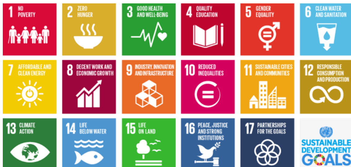
Figure 1: Sustainable Development Goals (SDGs)