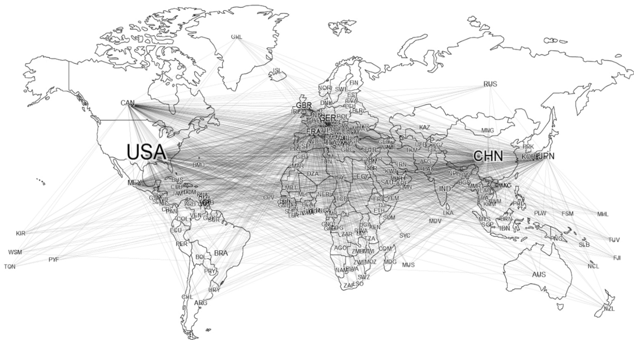
FIGURE 1 World trade discrete network in 2015