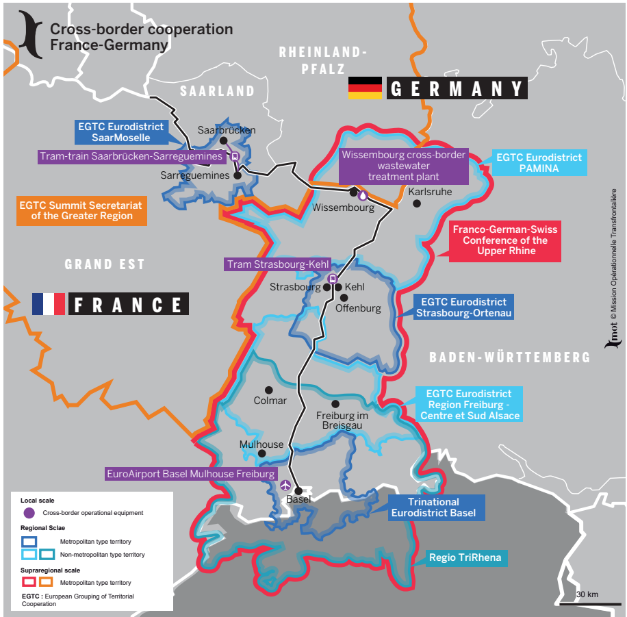
Figure 1: Cross-border cooperation between France and Germany

in the Rhine basin and the Greater Region in the basin formed by the Moselle and the Saar (see Figure 1).