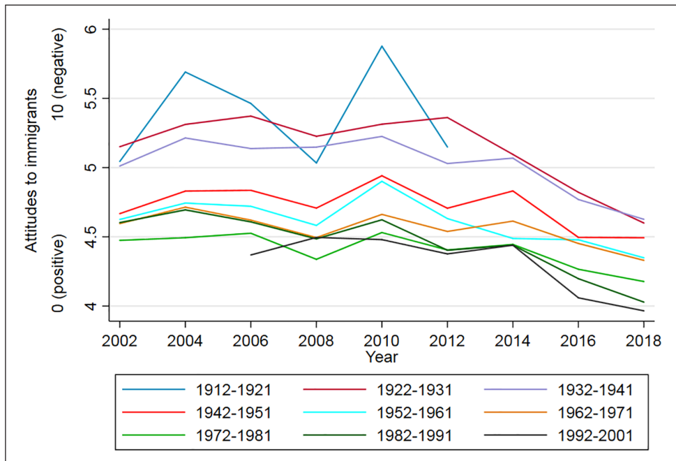
Figure 2. Attitudes toward immigrants among Western EU birth cohorts between 2002 and 2018.

decreases to a value below 5 on the 11-point scale for all cohorts. In further analysis, I examine whether this drop in opposition is associated with the gradual recovery of the European economy after the financial crisis or to the so-called long summer of migration. Whereas patterns in attitude shifts are similar for all birth cohorts over time, these shifts occur on different levels. The three oldest birth cohorts (born between 1912 and 1941) display the highest levels of anti-immigrant sentiments (average values predominantly above 5), while attitudes steadily become more positive among the younger cohorts (average values below 5).