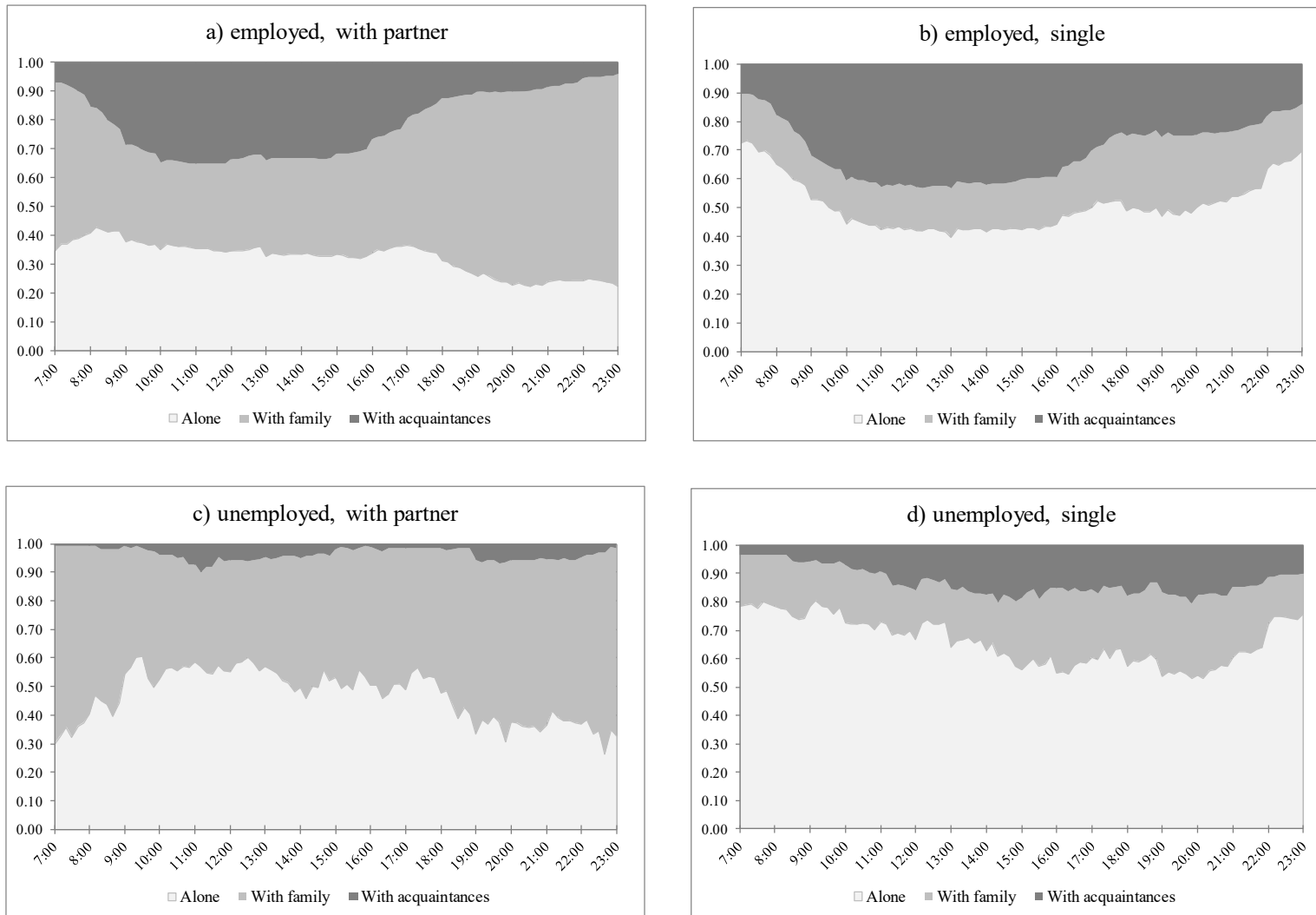
Figure 1: Social contacts over the course of the day, by employment and partnership status