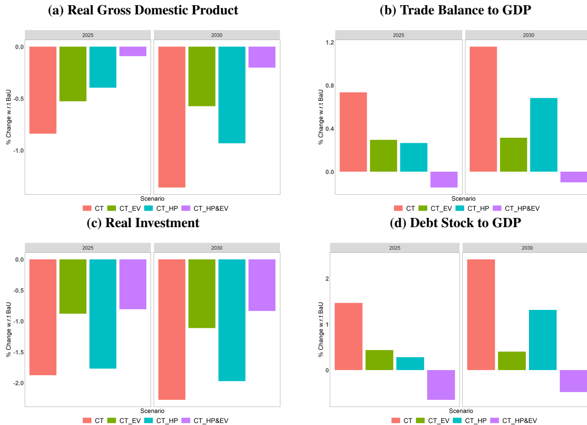
Figure 2: Macroeconomic Environment, % change w.r.t BaU

The relative boost in economic activity results in increased emissions in many sectors, creating the rebound effect discussed in the previous section. The bulk of these emissions come from increased electricity use of production sectors, as we have assumed that the composition of inputs into electricity generation do not change over time, this rebound effect could be limited when shifting towards low carbon electricity generation.