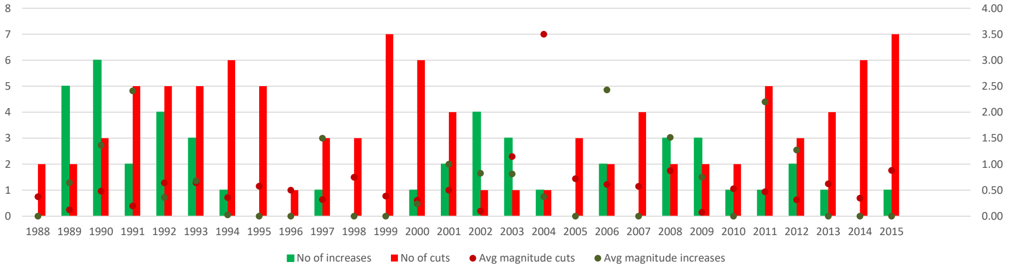
Number and average level of tax increases and decreases