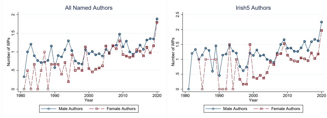
Figure 2 shows the average number of papers per year by authors of each sex, again for all named authors as well as Irish5 authors . A research-active author may or may not publish a working paper during a given year, so the average number of papers per year can be less than one. Men consistently publish more working papers than women.