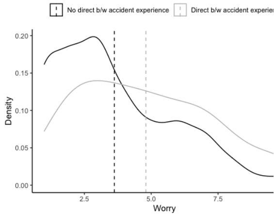
Figure A1: Worried Own bike/walk accident