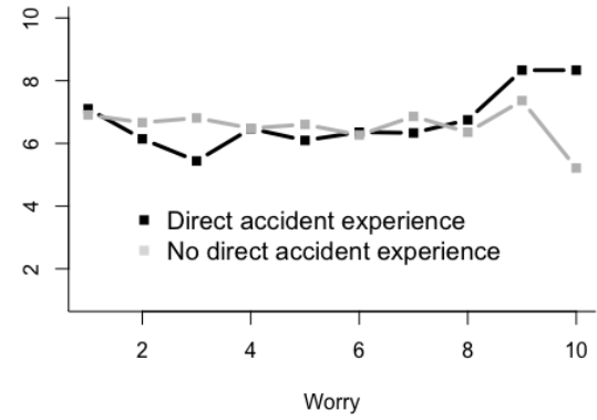
Figure A4: SWB by own car accident