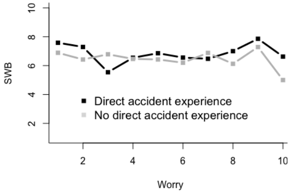
Figure A3: SWB by own Bike/Walk accident