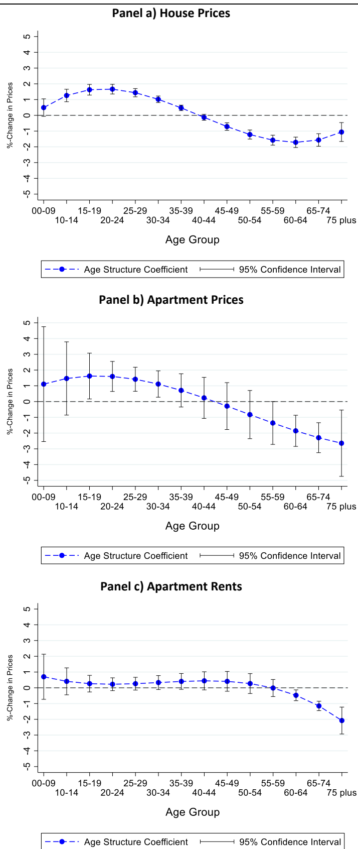
Figure 3: Aging and Real Estate Prices using the Entire Age Distribution

Note: Age-structure coefficients derived from a third-order polynomial in the spirit of Fair and Dominguez (1991) and Higgins (1998). Full set of object level and municipality control variables included. Standard errors clustered at the municipality level.