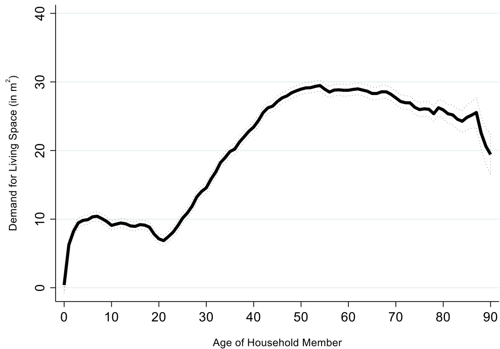
Figure 1: Demand for Living Space by Age (adjusted for Cohort Effects)

Own calculations based on the German Socio-Economic Panel. Wave v37 (1984-2020), age coefficients from a regression of living space (in m 2 ) on the number of household members in each age group (similar to Mankiw and Weil 1989) and annual survey fixed effects. N= 407,996, 55,883 households. 95% confidence bands. Standard errors clustered at the household level. 90 includes everybody aged 90 or older.