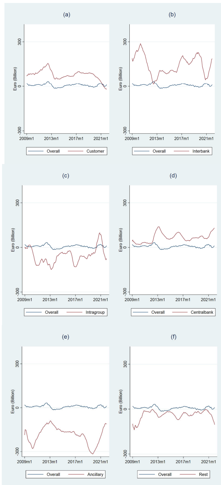
Figure 2: Development of monthly total net cross-border flow to German banks by different transaction categories

Notes: Data are monthly values (12-month moving averages), January 2009 – December 2021.