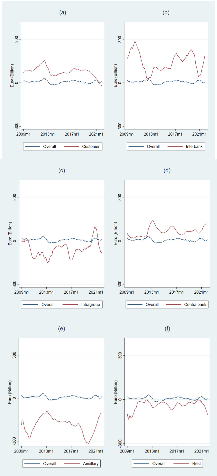
Figure 2: Development of monthly total net cross-border flow to German banks by different transaction categories