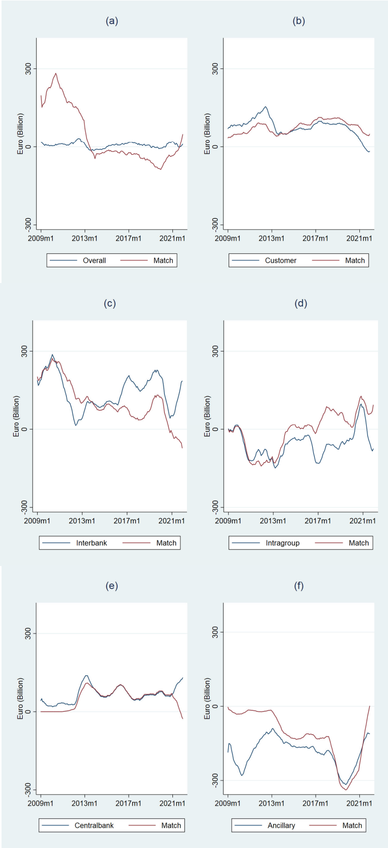
Figure 3: Matching quality of TARGET2 data with BankFocus by transaction category

Notes: Data are monthly values of monthly total net cross-border flow to German banks (12-month moving averages), January 2009 – December 2021.