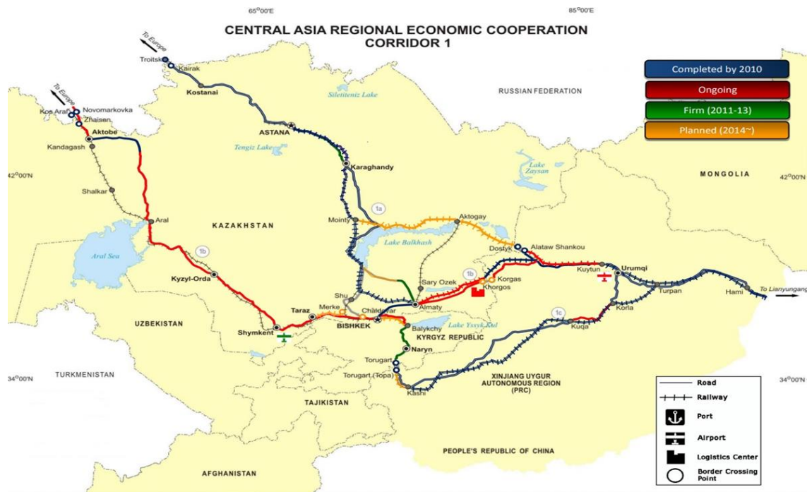
Fig. 4: Status CAREC Corridor 1