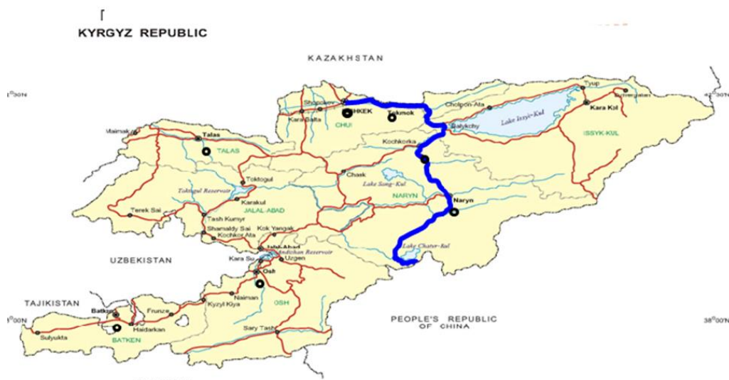
Fig. 1: Bishkek-Naryn-Torugart Road Rehabilitation Project