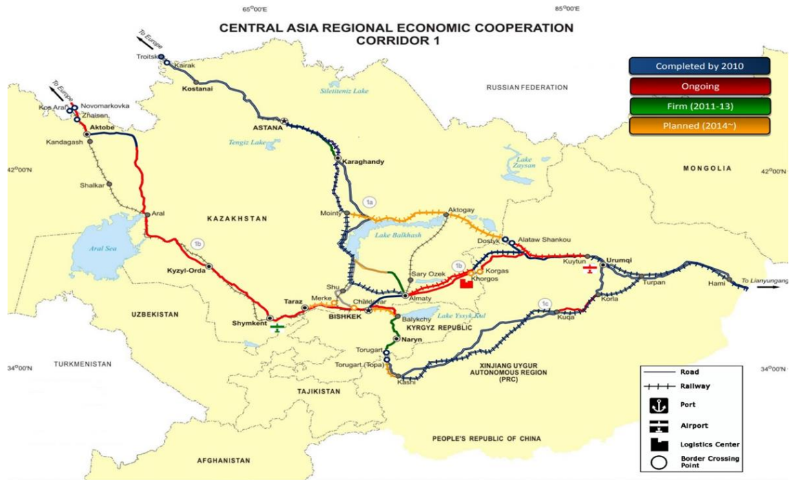
Fig. 4: Status CAREC Corridor 1