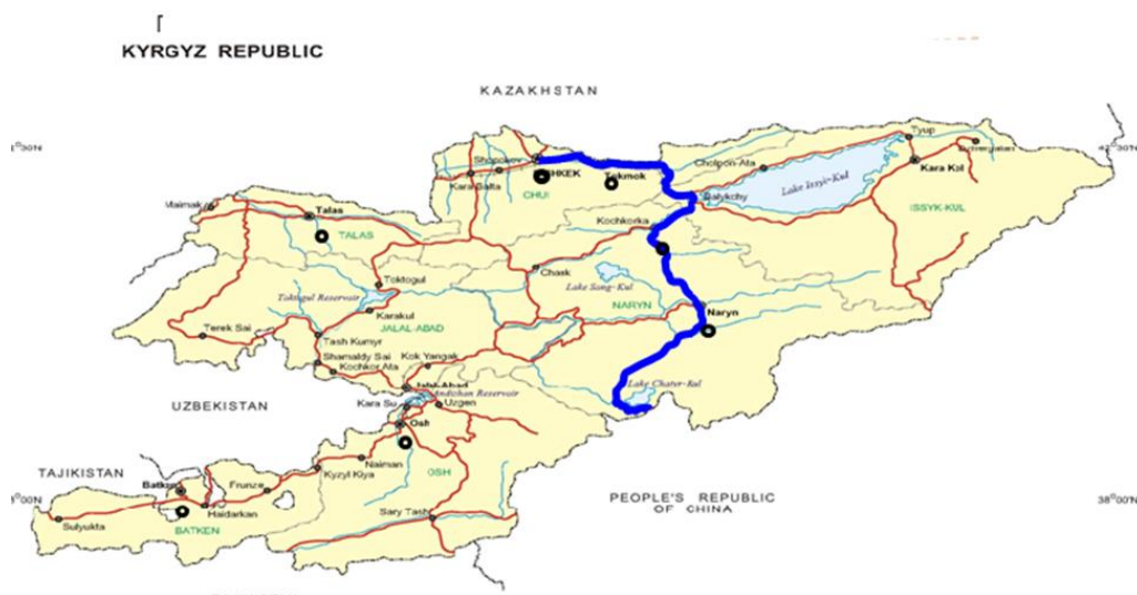
Fig. 1: Bishkek-Naryn-Torugart Road Rehabilitation Project