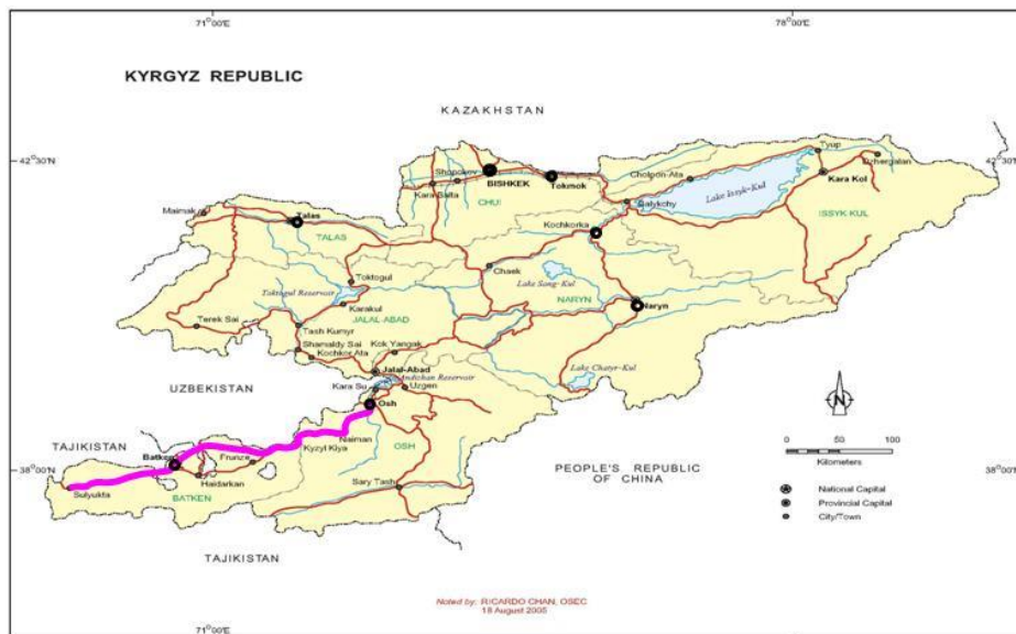
Fig. 2: Osh-Batken-Isfana Road Rehabilitation Project