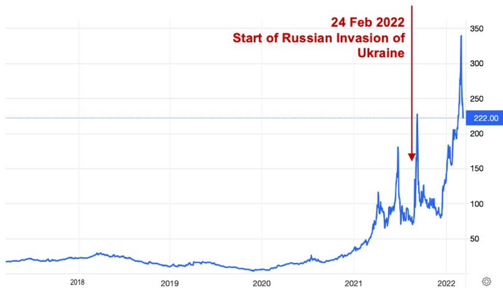
Figure 1: Wholesale Price of Natural Gas in Europe

The cost for natural gas is currently a major concern for EU countries. While the wholesale price has been more or less constant for years, starting in October 2021 prices have increased steeply. The resulting price increase is dramatic. The average price of a MWh of natural gas on the Dutch market was below €20 in 2020. In mid-September 2022, the average wholesale price of natural gas hovers around 200€/MWh. Figure 1 makes clear that much of the rally already began before the start of the Russian invasion of Ukraine in February 2022, but prices have increased markedly since then.