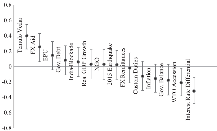
FIGURE 3 Bivariate correlations with TMI. Note: Dots represent bivariate Pearson correlation coefficients between our capital flight trade misinvoicing (TMI) measure and the respective variables. Bars indicate 90% confidence intervals calculated using Fisher's z -transform. See Appendix A for variable definitions and sources

for IOI and EUI separately. The striking finding is that the results for the TMI series are indeed driven by IOI, which does not come as a surprise given the time-series dynamics displayed in Figure 2 earlier. The FX Aid coefficient on EUI is slightly negative and close to zero. Statistically, it is insignificant. By contrast, the aid coefficient on IOI is close to one and significant at the 5% level.