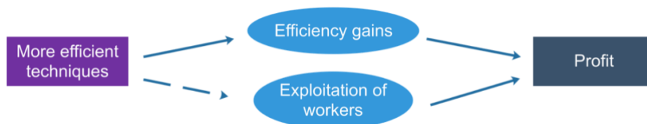
Figure 4: Sources of profit derived by more efficient techniques

Costs can be cut by increasing the efficient use of resources or different kinds of inputs, often through technology. It can also be achieved by increasing labor productivity, through more efficient techniques; for instance, changing the way that workers pick strawberries in a field. Automation is increasingly used to perform tasks that employees would otherwise perform, which increases both types of efficiency. Labor productivity gains from automation can result in fewer jobs and, thus, contribute to unemployment unless those jobs are compensated for elsewhere in the economy (EOP, 2016). Likewise, more efficient techniques may be harmful to employees, for instance if workers are required to perform quick, repetitive motions for a whole work shift ( Figure 4 ). However, in terms of direct inputs and impacts, increasing productivity generally derives profit from efficiency gains ( Figure 4 ).