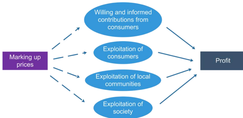
Figure 1: Potential sources of profit generated by marking up prices