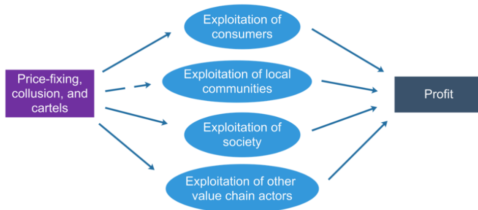
Figure 2: Sources of profit for price-fixing, collusion, and cartels

sources of profit for this type of strategy, note that the lines from the strategy to the source are solid rather than dotted lines, indicating more certainty about the source of profit.