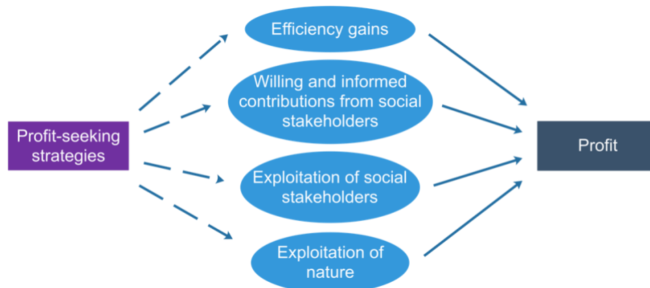
Figure 8: Potential sources of profit

Figure 8 illustrates how this way of thinking about profit-seeking strategies translates into a conceptual framework that clarifies the potential sources of profit: efficiency gains; willing and informed contributions from social stakeholders; exploitation of stakeholders; and exploitation of nature. This framework is intended to provide the basis for deeper and more concrete explorations of the relationship between profit and sustainability, by looking at how different strategies derive profit from a finite set of different sources. As such, it can be used to qualitatively assess the (un)sustainability of particular strategies, businesses, and markets. There might be sources that I have not found in my study, which can be added in future research.