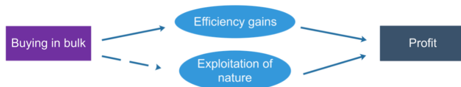
Figure 5: Sources of profit from buying in bulk

hospitality industries. But the direct risk for environmental harm from buying in bulk is minimal.