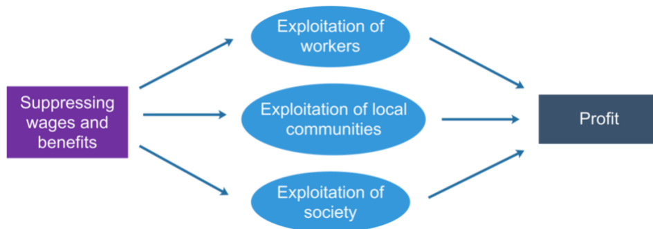
Figure 6: Sources of profit from suppressing wages and benefits

Even when workers are on long-term contracts with benefits, employers often have the upper hand. Unions are typically seen as a way for workers to use collective bargaining to balance the power dynamics between employers and employees. However, union-busting is another effective profit-seeking strategy (Logan, 2004). Large companies, such as Amazon, Walmart, and Verizon have all been documented in their use of union-busting to keep their labor costs low and maintain (or increase) their profitability (Feingold, 2013; Menegus, 2018; Sainato, 2019).