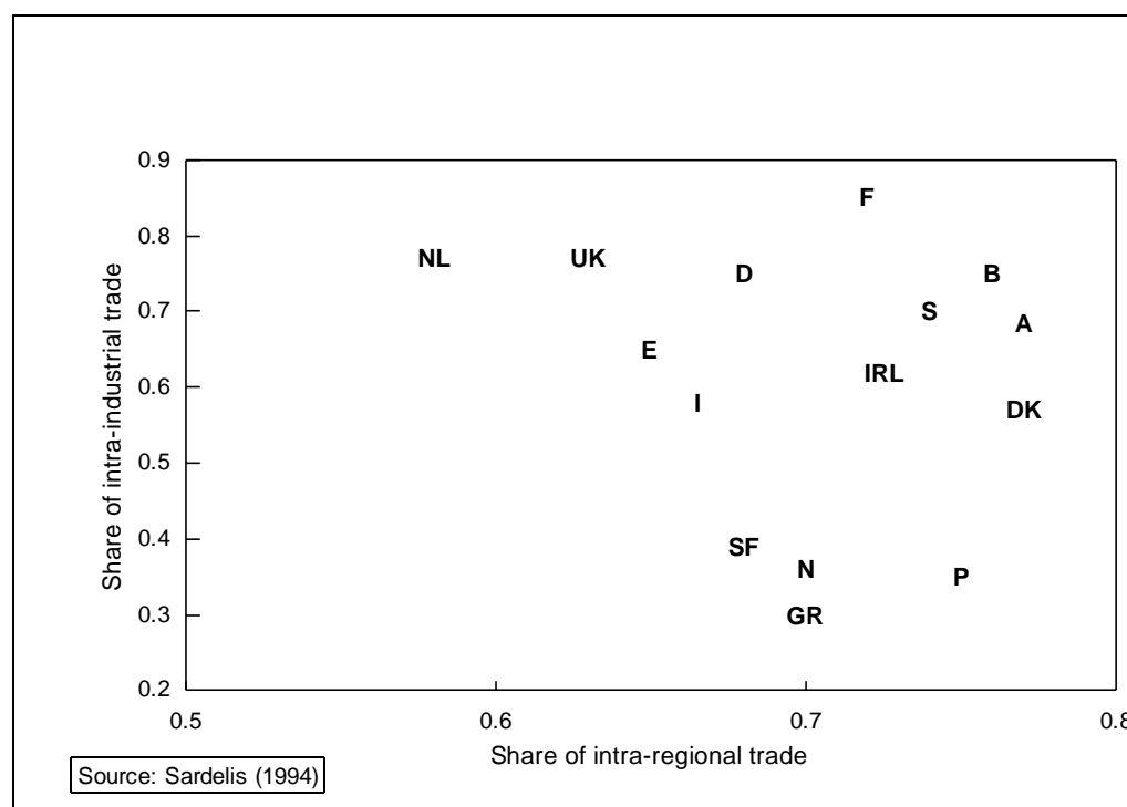
Figure 3 : Integration of trade

It was shown in Ch. 3.3 already that Austria's main trade relations are with the EU and EFTA countries. The establishment of EMU will imply the elimination of exchange rate risk in a potentially larger number of trade partners (assuming that at least the present ERM "hard core" countries will participate from the start). This should in turn trigger dynamics enhancing trade, financial and labour market integration, bringing the Union further towards an OCA.