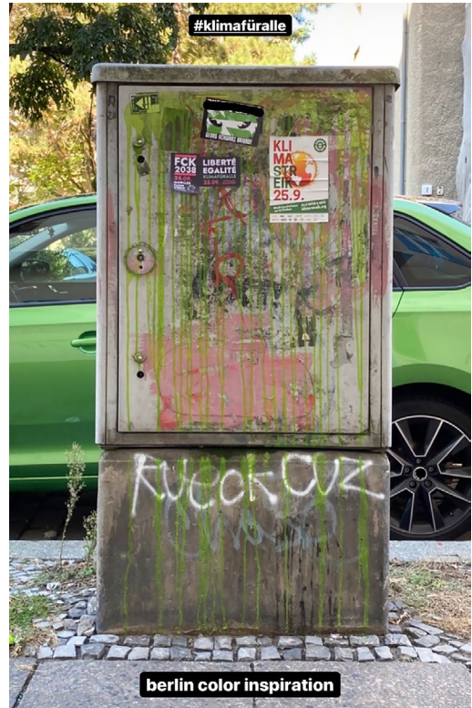
Figure 2. Screenshot of a post referencing Berlin.

Mediated spaces – This section will look further into the ways that urban spaces are mediated. The post below (Figure 2), by a sustainable Berlin-based designer, is an example of how the city is represented online. It features a familiar urban scene. Perhaps the designer took the photo on her way to work or during another everyday situation. The