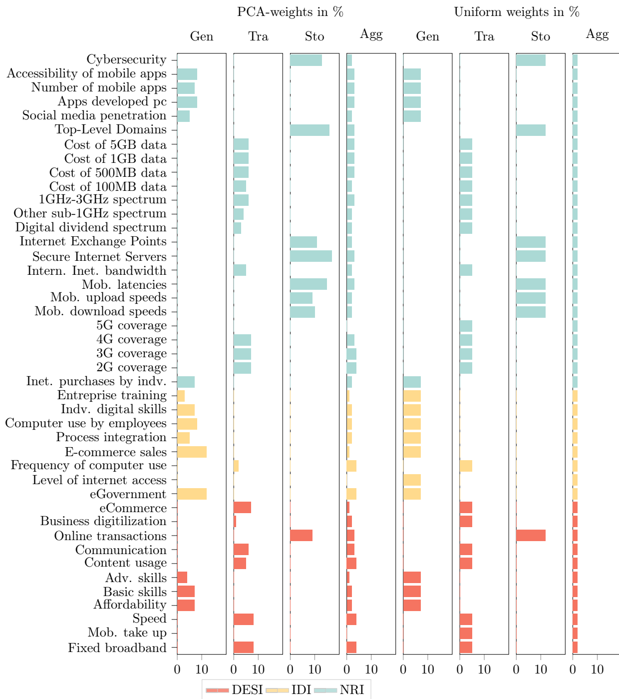
Figure A.2: The composition of the eight digitalization indices