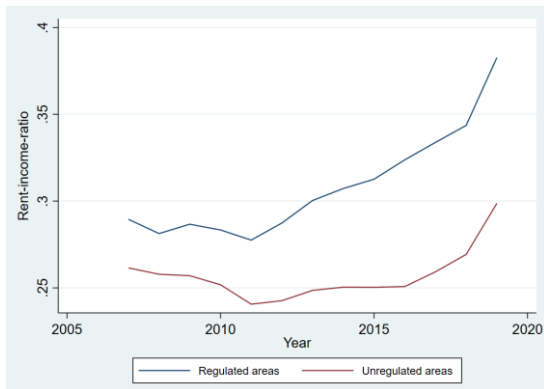
Figure 2: Evolution of average rent-income ratio

Although the approach to estimate the average treatment effect via a difference-in-differences setup based on a two-way fixed-effects linear regression model is used in many studies to identify causal effects, this procedure is criticized in various studies if it comes to staggered treatment and time varying treatment effects (De Chaisemartin & D'Haultfoeuille, 2020; Goodman-Bacon & Marcus, 2020). To reduce the possibility of a biased estimator, the rent brake effect is additionally estimated combined with interaction terms for each year in which it is introduced (table 4).