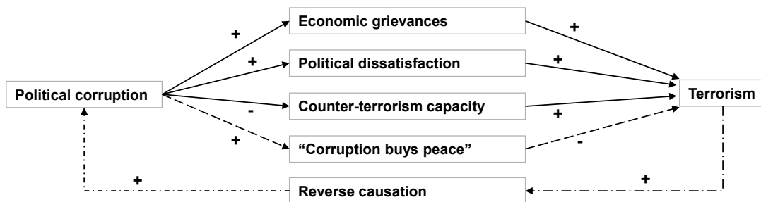
Figure 1: THE CORRUPTION–TERRORISM RELATIONSHIP

Figure 1 also alludes to two further points. First, an argument can be made that corruption may actually mitigate terrorist activity. We discuss this issue in Section 2.4 below. Second, potentially there is feedback between terrorism and political corruption, which may complicate empirical analyses of the effect of corruption on terrorism. We