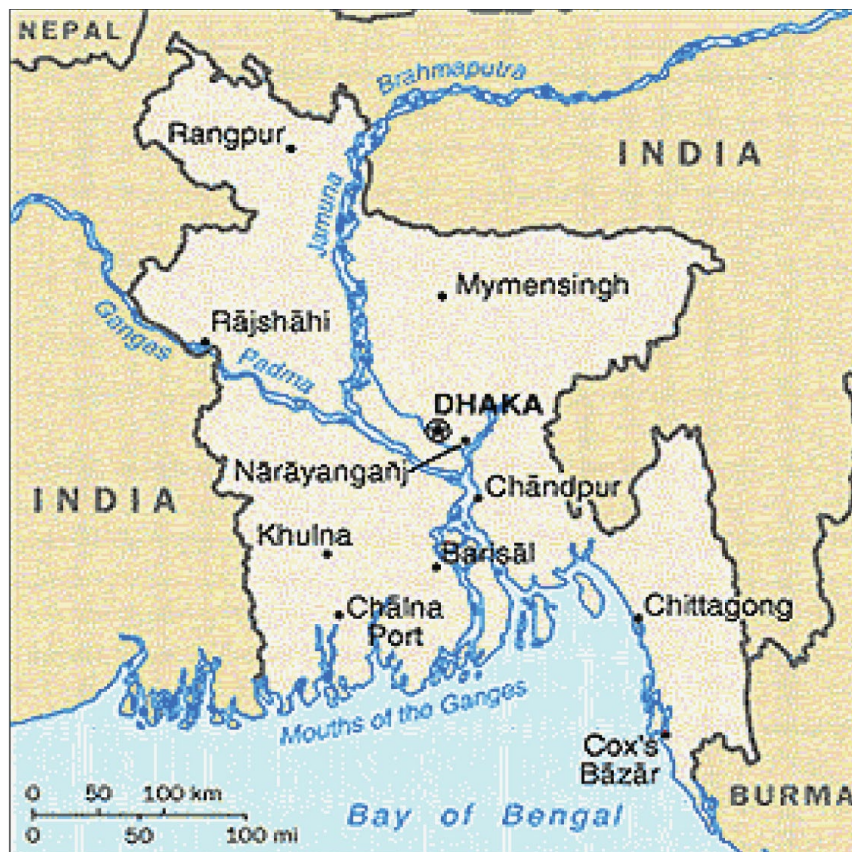
▶ Figure 1: BANGLADESH, with major river systems surrounding Dhaka

These river systems are vital to the environmental, economic and social health of the communities in which they are located, and highlight the need to work with local stakeholders to build their awareness and capacity in order to increase the effectiveness of both EIA and the overall environmental sustainability of industrial activities associated with the garment sector.