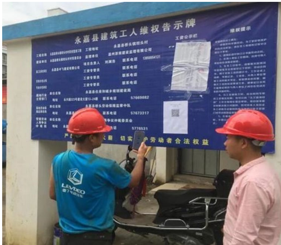
A photo taken of the construction site information bulletin board in Yongjia County, Wenzhou City, Zhejiang Province, May 2020.