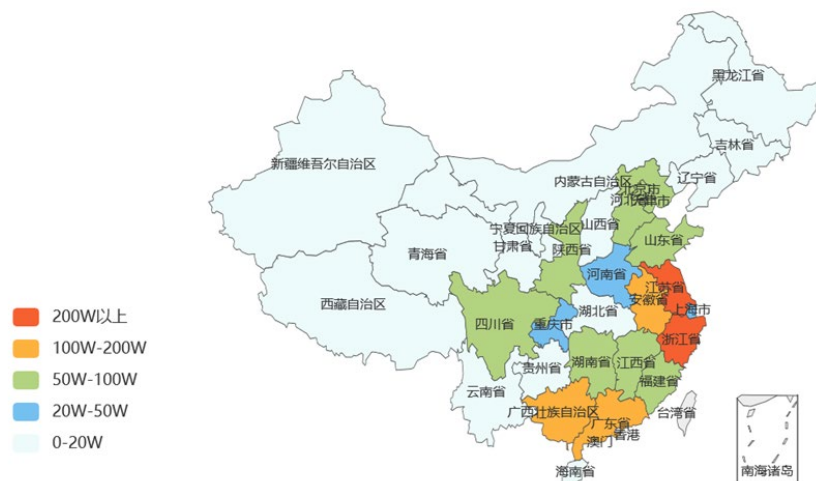
► Figure 1 Registered migrant workers in construction on the NCWM&SI system nationwide as of December 2020