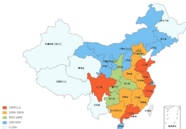
► Figure 2 Registered migrant workers in construction on the NCWM&SI system nationwide as of August 2021