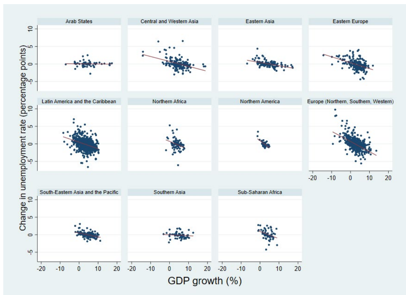
► Figure 4: Changes in unemployment rate and GDP growth by geographical region

Source: LFS data set; Note: Figure 4 also includes additional data points for countries where only very limited data was available, which were consequently excluded from the selection of 75 countries in the LFS data set. Therefore, data points are also displayed for the “Arab States” and “Sub-Saharan Africa” regions.