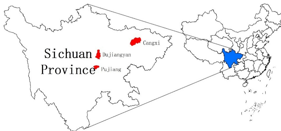
Figure 1. Map of the study area.

This study mainly relies on the household survey data obtained from a questionnaire survey of kiwifruit growers in Cangxi, Pujiang, and Dujiangyan, three kiwifruit-producing districts in Sichuan Province in August 2016, as shown in the map of the study area. (Figure 1). We trained a survey team of five enumerators and two supervisors. First, we trained participants on the questionnaire and conducted a pre-test survey to identify missing and inappropriate questions and other potential problems in the questionnaire. Then, we modified the questionnaire accordingly and collected a total of 224 samples by the random sampling method. A total of 186 valid samples were included in the study, accounting for 83% of the total number of samples. All questions and variables were designed based on expert knowledge, existing literature, and preliminary local surveys.