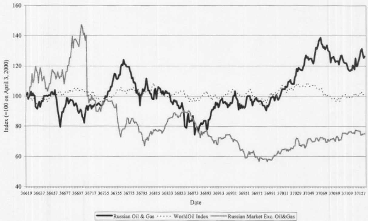
Figure 1: Returns for the World Oil & Gas Index, the Russian Oil & Gas Index, and the Russian Market (Excluding the Oil & Gas Industry), April 2000 - September 2001

Note: The graph plots the index returns for the World Oil & Gas Index (sourced from...), the Russian Oil & Gas Index and the Russian Market Index Excluding Oil & Gas Firms (sourced from...) from April 1, 2000 to September 30, 2001.