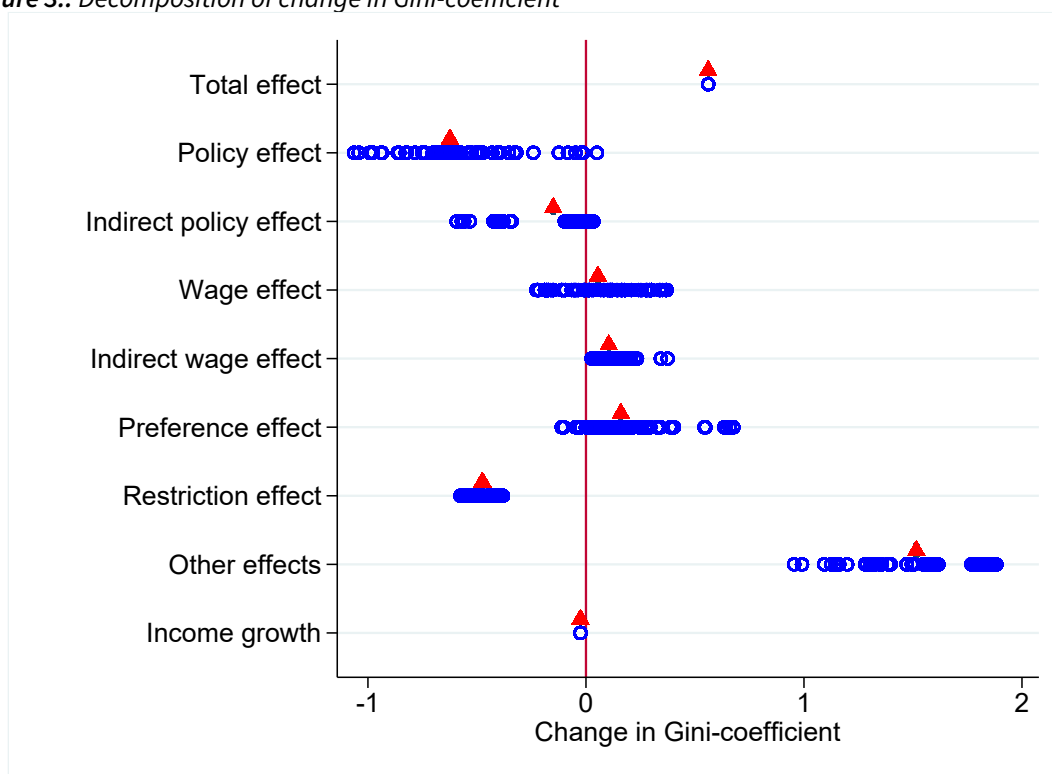
Figure 3.: Decomposition of change in Gini-coefficient

The triangles mark the Shorrocks-Shapley Value of each effect. The circles represent different decompositions.