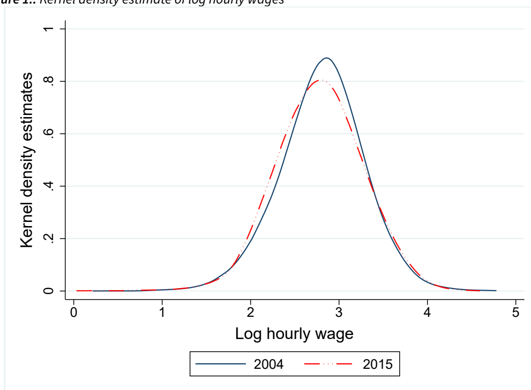
Figure 1.: Kernel density estimate of log hourly wages

Wage distributions include observed wages for employed individuals. Wages of based period population are uprated with uprating parameter \alpha .