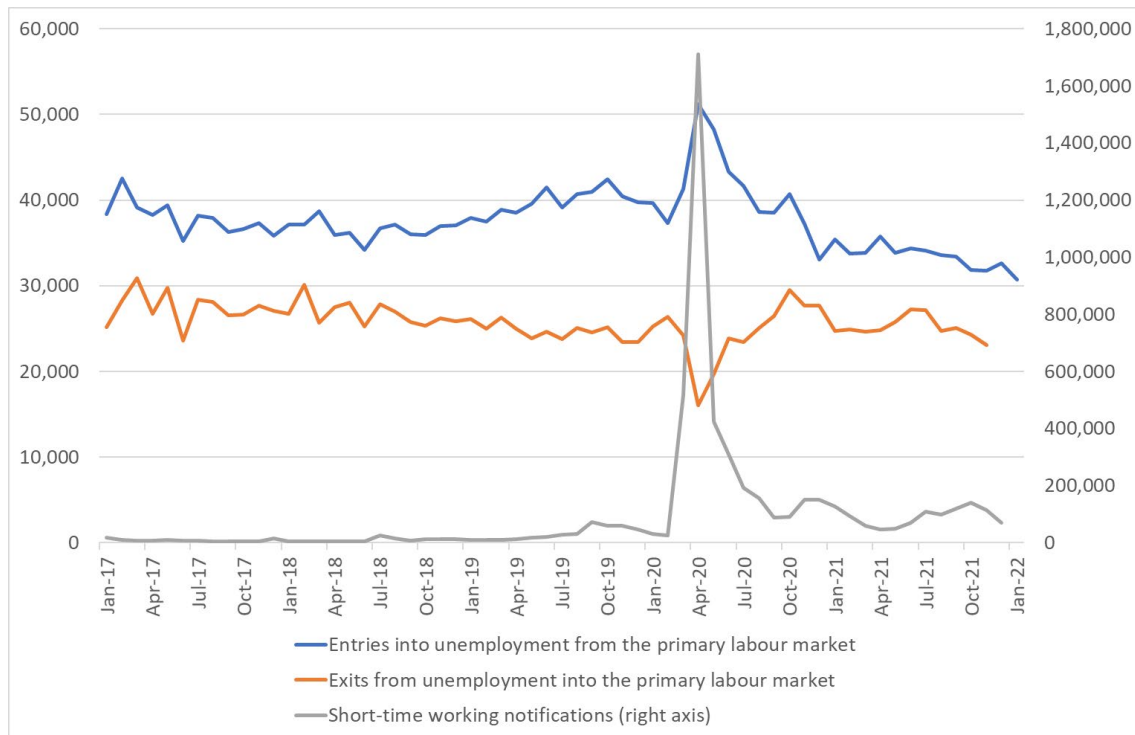
Figure 2: Course of seasonally adjusted labour market variables for the manufacturing industry and the construction industry in number of persons (January 2017 to January 2022)