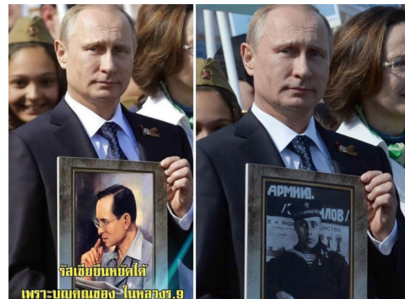
Figure 2: Photoshopped Image of Putin

as a Transitional or Hybrid regime as Ukraine receives a Democracy Percentage of only 39 % in the Nations in Transit report. 12 Thus, it appears that the Thai volunteers and Thai liberal netizens interpret the war in Ukraine by projecting their own struggle into it. This is similar to the interpretation of the war by the ultra-right wing in Thailand. As mentioned above, based on Ukraine's desire to join NATO, they have embraced the reasoning that Putin is preemptively defending his country from the threat that NATO expansion allegedly poses for Russia.