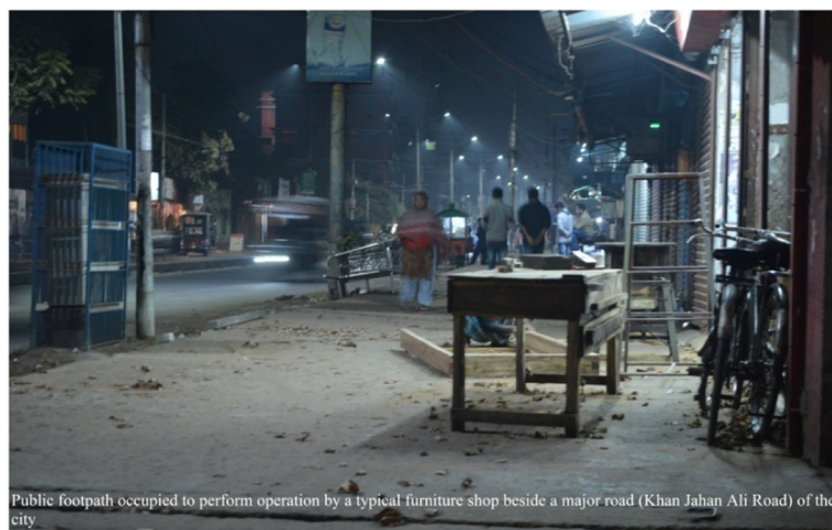
Fig. 3 Workers making door frame on public footpath beside a major road

Again, acquaintance with the local people; convenience in commuting from home to factory; looking after family; and ease in overseeing operations were important personal factors to locate manufacturing units near to residences as revealed from the following examples: