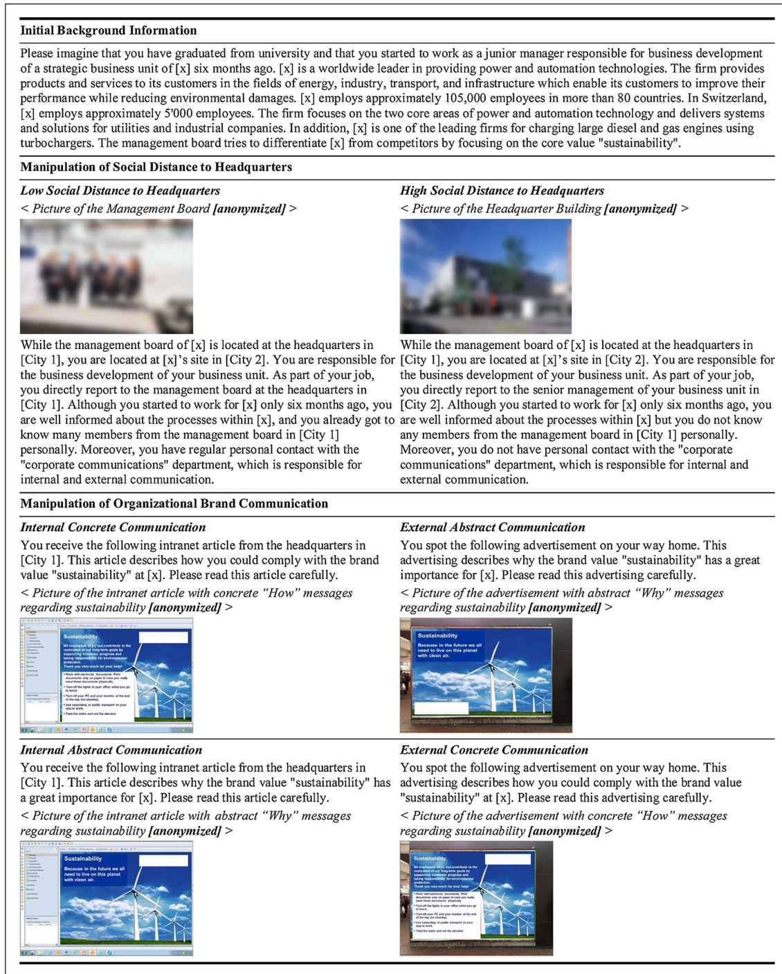
Figure 1. Stimuli in the experimental study. Translated stimuli. Due to a nondisclosure agreement, the presented experimental stimuli are anonymized.

The present studies are the first to offer a theoretical integration and empirical investigation of the combined effects of internal versus external brand communication on employees' organizational identification. Historically, separate lines of research investigated the effect of organizational communication and focused on either internal or external communication only. This research combines those perspectives