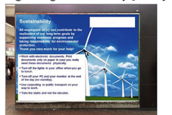
Figure 1. Stimuli in the experimental study.

< Picture of the advertisement with concrete "How" messages regarding sustainability [anonymized] >