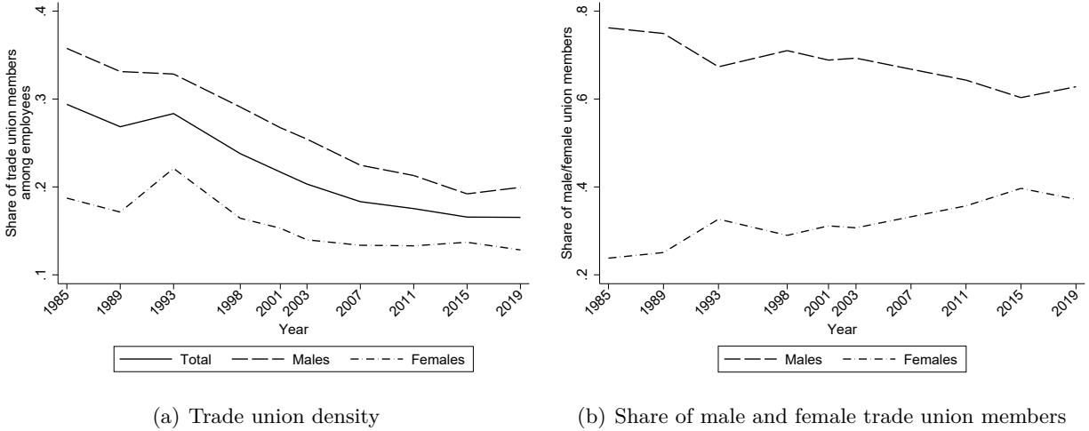
FIGURE 1: Trade union membership