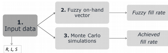
Figure 2. Experimental design

where T indicates the total number of replenishment cycles. To assure the consistency of the results, Monte Carlo simulations accomplish 30 replications of each case using the average of these replications as the final achieved fill rate.