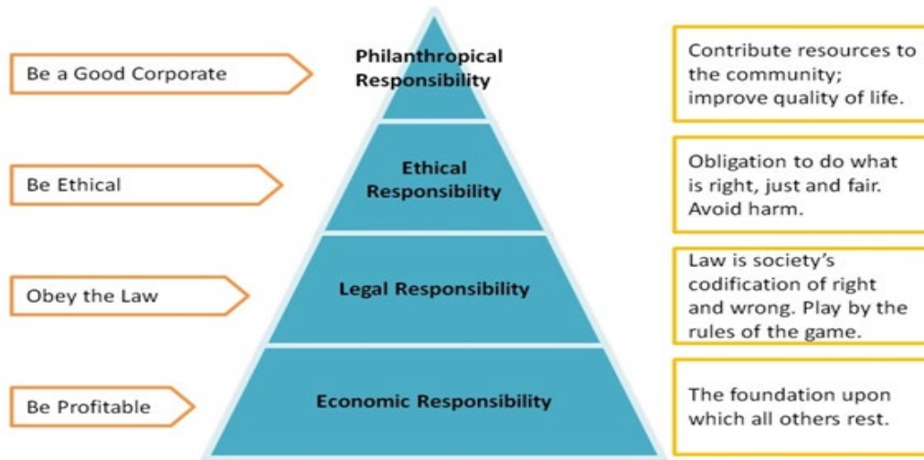
Figure 1: Carroll's Corporate Social Responsibility Pyramid

Source: Carroll, A.B. (1991). The pyramid of corporate social responsibility: towards the moral management of organizational stakeholders . Business Horizons , Vol. 4 No. 3, pp. 42.