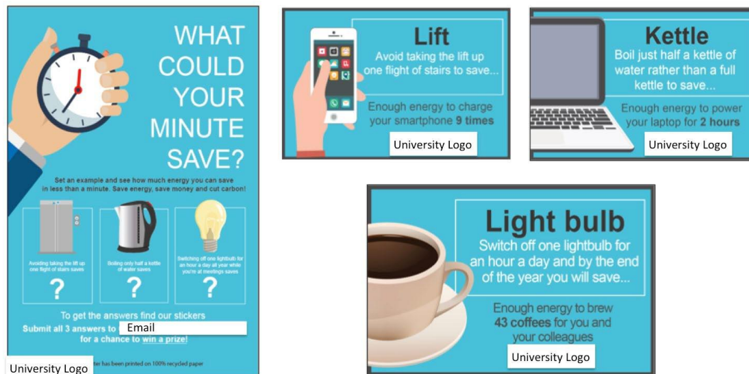
Figure 2. Intervention Materials