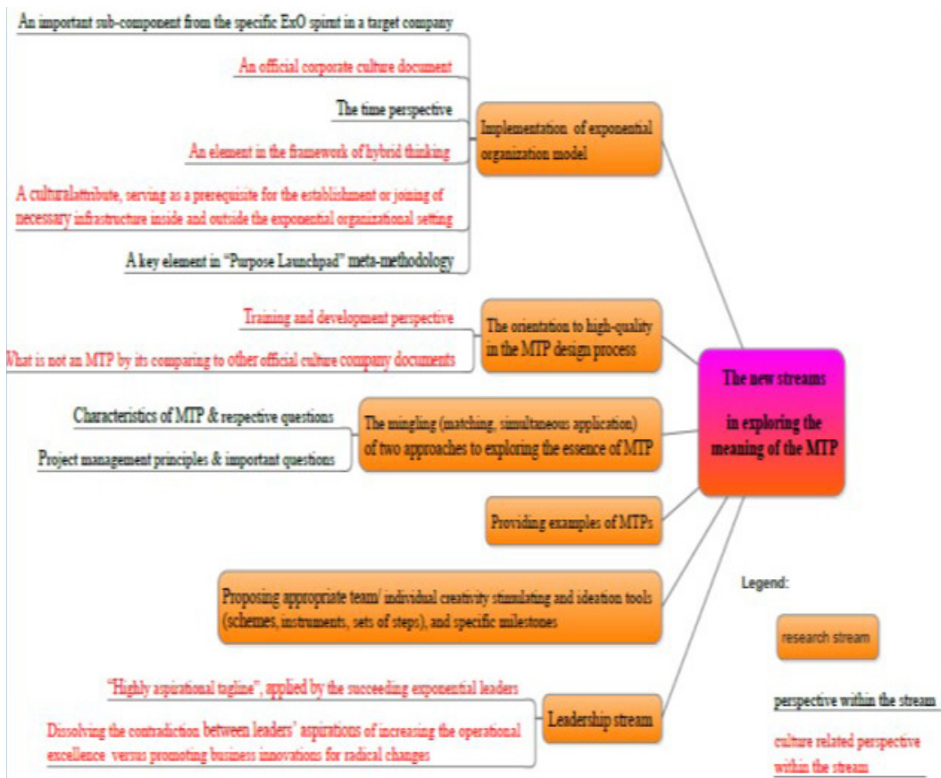
Figure 2: New streams in elaborating the meaning of the MTP