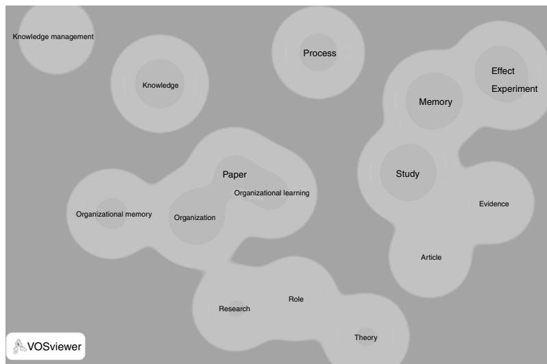
Fig. 5. Visualization of the density of each item.

The most repeated and used terms and words in the first study were aggregated into five clusters of association, with the terms “organizational learning” and “knowledge” displaying the greatest density or the highest exact repetition of words. Following the terms “organization”, “knowledge management”, “process”,