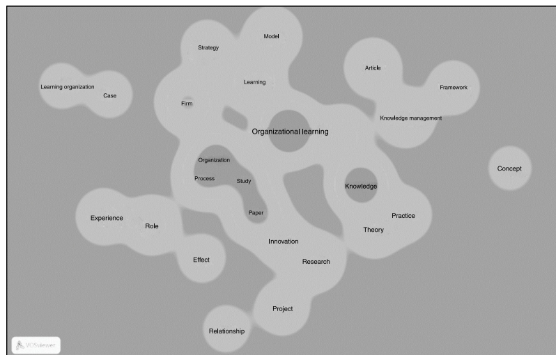
Fig. 2. Visualization of the density of each item.

Research on organizational learning has been under development since the 1960s while this study conveys the expansion in this field of study especially since 2009.