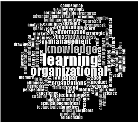
Fig. 3. 100 exactly most repeated words.