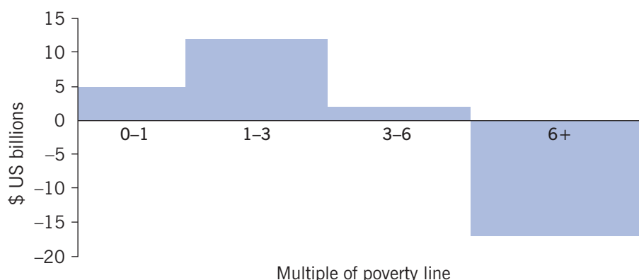
Figure 1. Net change in income across the income-to-needs distribution of increasing the US minimum wage from $7.25 to $10.10 per hour

Note: The multiple of the poverty line, also known as the income-to-needs ratio, is the ratio of family income for a family of a given size to the poverty line for a family of that size.