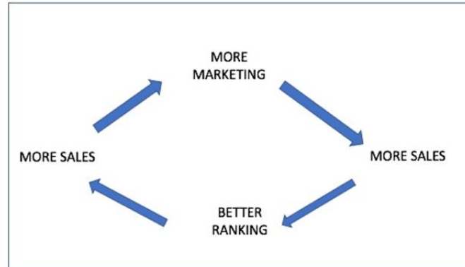
Figure 2. Relation between marketing and sales in Amazon