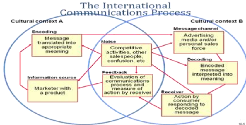
Figure 2. Marketing communication