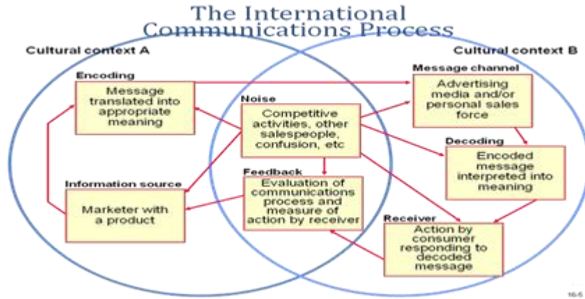
Figure 2. Marketing communication