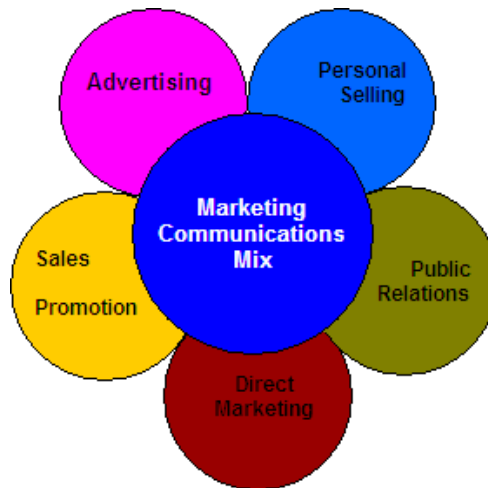
Figure 1. Marketing communication mix

The marketing communication mix will also be influenced by these various factors. However, before that the international promotional strategy has to be developed various other steps needs to be taken. These includes- the study the target market, determining till what level standardization is required, developing the promotional mix, creating the message for promotion, selecting the effective media and establishing the control mechanism (Figure 1 and 2) (Kotler et al, 2015).