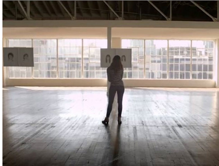
Figure 4. A subject looking at her sketches

Advertisement such as the Dove “You are more beautiful than you think.” uses a pull strategy. The strategy directly targets the end customer for promotions (Varadarajan, & Jayachandran, 1999). This is done to stimulate the customer so that it creates a demand for the advertised product (in this case increase or create brand loyalty).