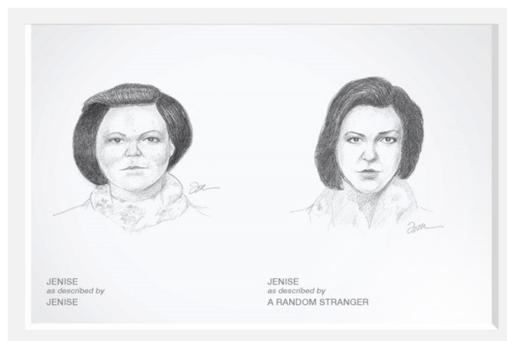
Figure 3. Dove real beauty sketches

The online advertisement campaign was launched by the renowned beauty care product brand Dove in 2013. Since then the advertisement has been a phenomenal success and became viral with more than 114 million total views within a month (Business Insider, 2013). The narrative of the advertisement is as follows. The tagline of the advertisement is “You are more beautiful than you think.” The advertisement articulates a social experiment conducted by Dove. In the advertisement several women were asked to describe themselves with particular emphasis on facial features. An FBI trained forensic artist drew sketches of women without actually seeing them. The artist then drew sketches of the same subjects (women) but the description of features was provided by a stranger who has seen the subjects. The sketches were then shown to subjects who were flattered to see that the sketch drawn from the description of strangers were in all cases more flattering than the one described by the subject themselves. The reaction of the women seeing the sketches were recorded and the experiment was made into an online video. The video was extremely emotional and touched the heart of a lot people. The video is available in the Dove real beauty sketch website (Dove Real Beauty Sketch, 2013). Figure 3 and 4 provides two illustrations of the experiment.