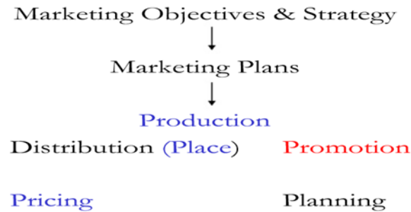
Figure 2. Marketing Communication Mix