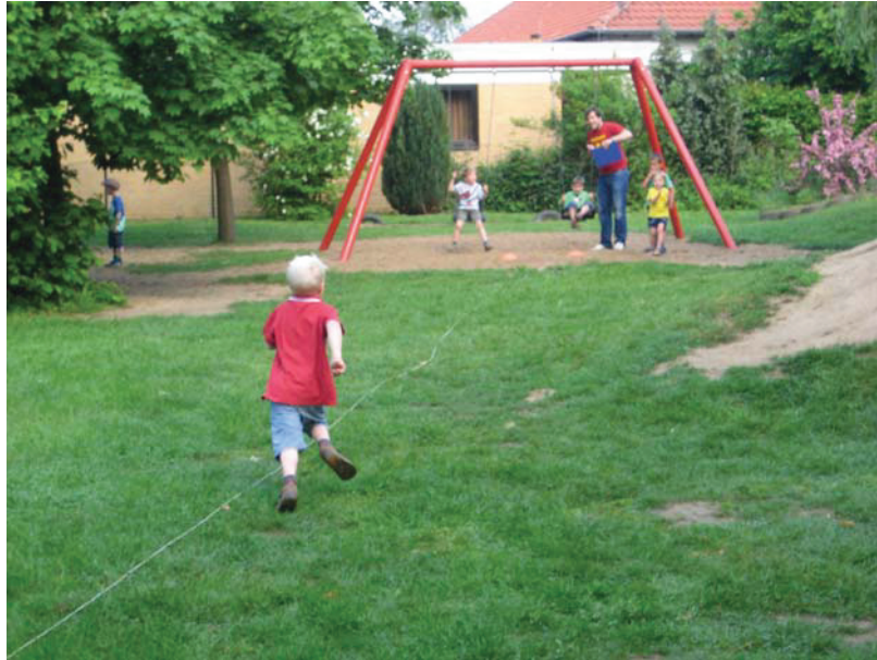
Figure A.2: Children during the task