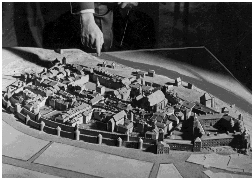
Fig. 4: An Old Town model from Huberta Groß' documentation "Neue Deutsche Stadt Warschau" (1940), in: NAC 2-8986