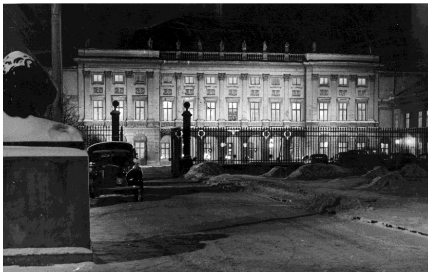
Fig. 6: The Council of Ministers Palace, transformed into the German House (1941)