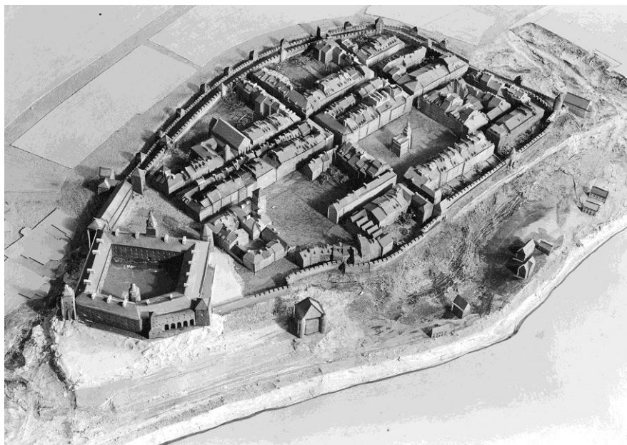
Fig. 5: Same model at the „Warsaw of the Future” exhibition (here without the cathedral) (1936), in: NAC 1-U-8487-7