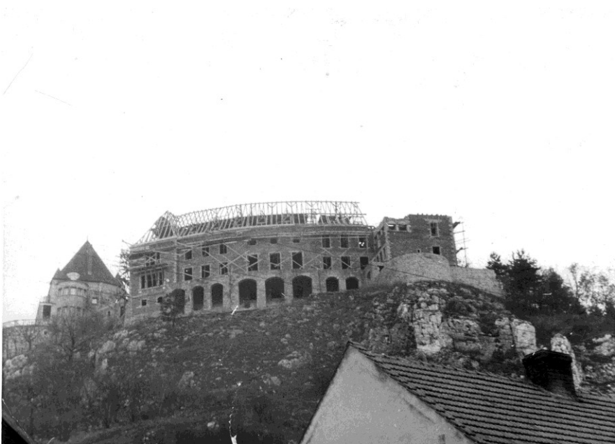
Fig. 3: Construction of the Przegorzały Castle (1942), photograph by Ewald Theuer-garten, in: NAC 8646a