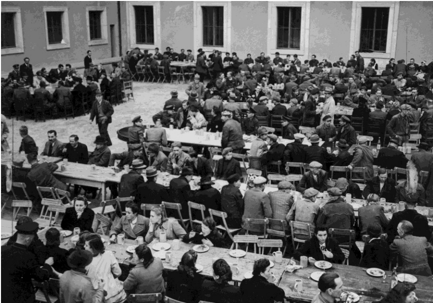
Fig. 2: Polish laborers rebuilding the Wawel Castle (1943), in: Narodowe Archiwum Cyfrowe (NAC) [Polish National Digital Archive] 2-6049